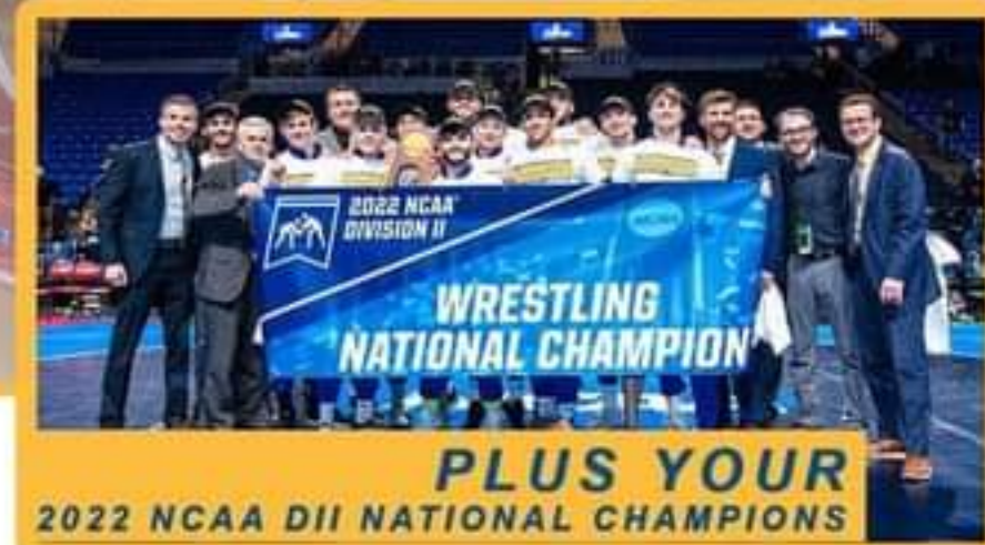
PLUS YOUR 2022 NCAA DII NATIONAL CHAMPIONS